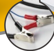
Or crocodile clips