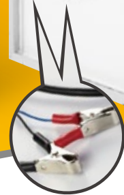
Or crocodile clips