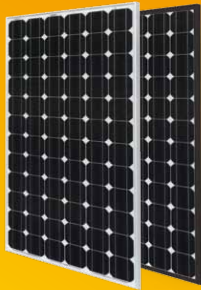
OPXXX-M-B Black Frame OPXXX-M-BB Black Frame & Black Backsheet