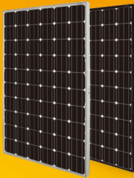
OPXXX-M-B Black Frame OPXXX-M-BB Black Frame & Black Backsheet

OMNIS photovoltaic Modules are constructed with high efficient solar cells and produce higher output per module than others in its class. This industrial grade module is an industry standard among various industry professionals.